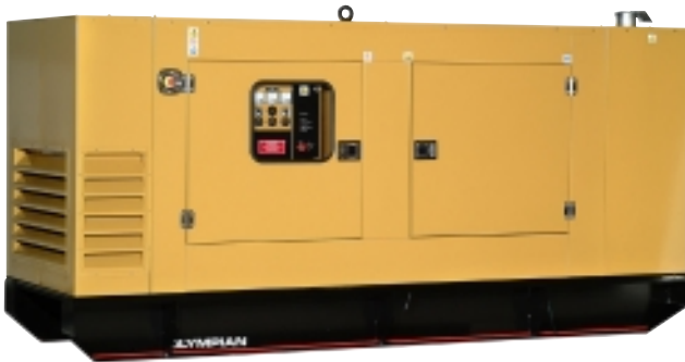
Generator Set Pictured May Include Optional Accessories

Exclusively for distribution in the EAME territory